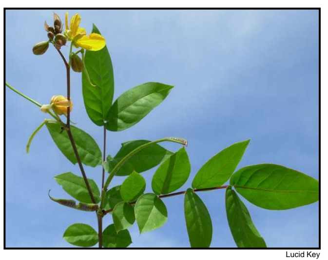
Coffee Senna, Sickle Pod Senna occidentalis