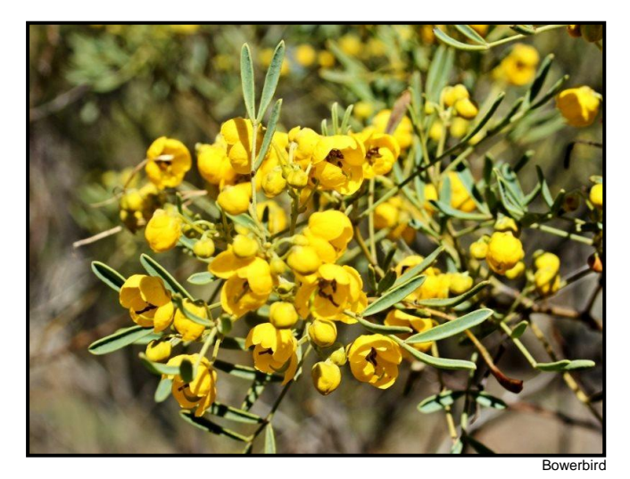
Desert Cassia Senna artemisioides nothosubsp. coriacea