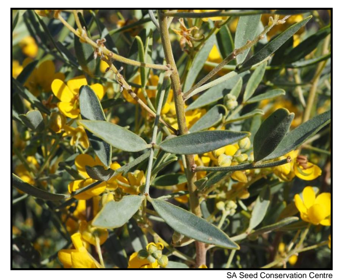
Four-leaf Desert Senna Senna artemisioides subsp. quadrifolia