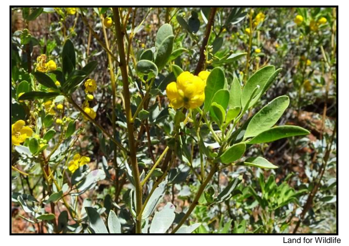
Oval-leaf Cassia Senna artemisioides subsp. oligophylla