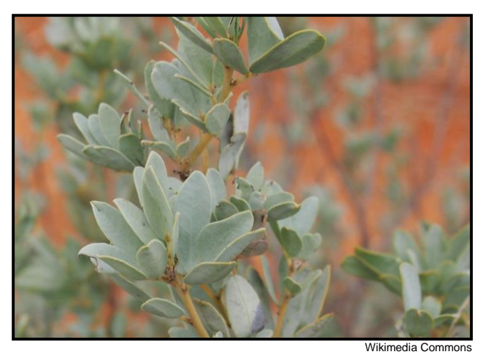
Senna artemisioides subsp. alicia