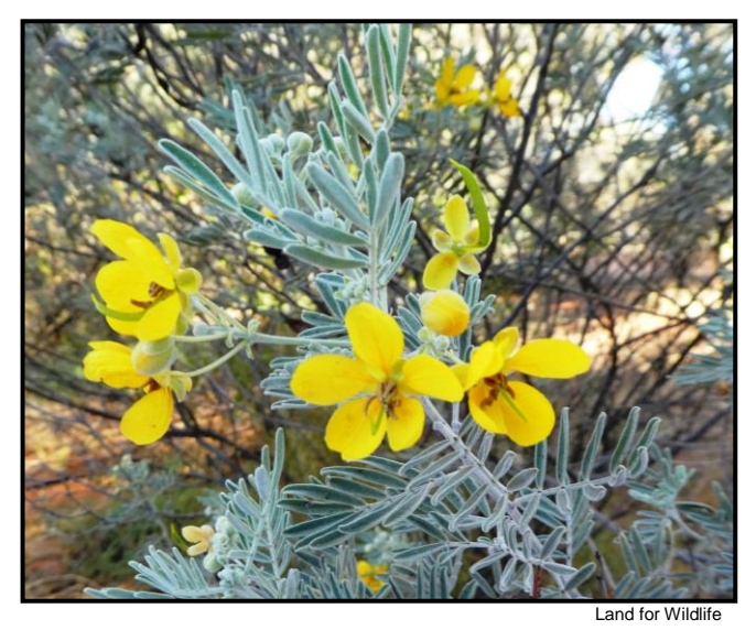
Dense Cassia Senna artemisioides nothosubsp. sturtii