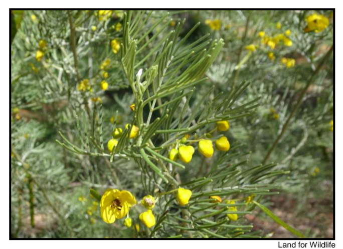
Silver Cassia Senna artemisioides nothosubsp. artemisioides

Senna is a large genus of flowering plants in the legume family Fabaceae. The leaves of this genus are pinnate with opposite paired leaflets, inflorescences have five sepals and five yellow petals, and the fruit is a legume pod containing several seeds. They can be germinated easily from seed once a corner has been nicked to allow water to penetrate. In central Australia, there are many species, some of which are shown below.