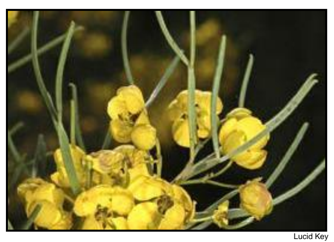
Woody Cassia Senna artemisioides subsp. petiolaris