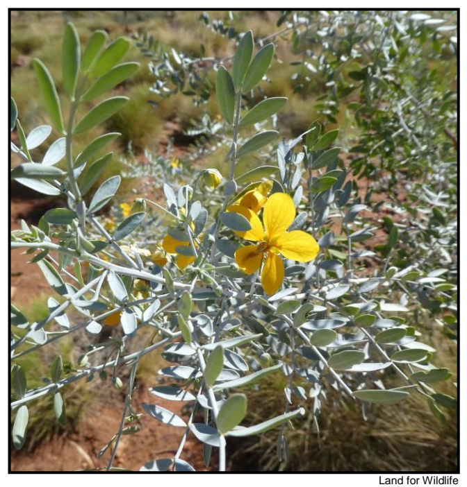
White Cassia Senna glutinosa subsp. pruinosa