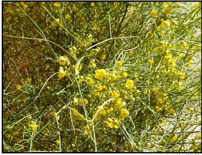
Desert Cassia, Broom Bush, Punty Bush Senna artemisioides subsp. filifolia