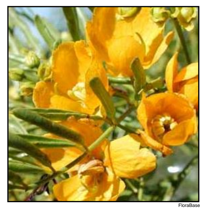
Sticky Cassia Senna glutinosa subsp. glutinosa