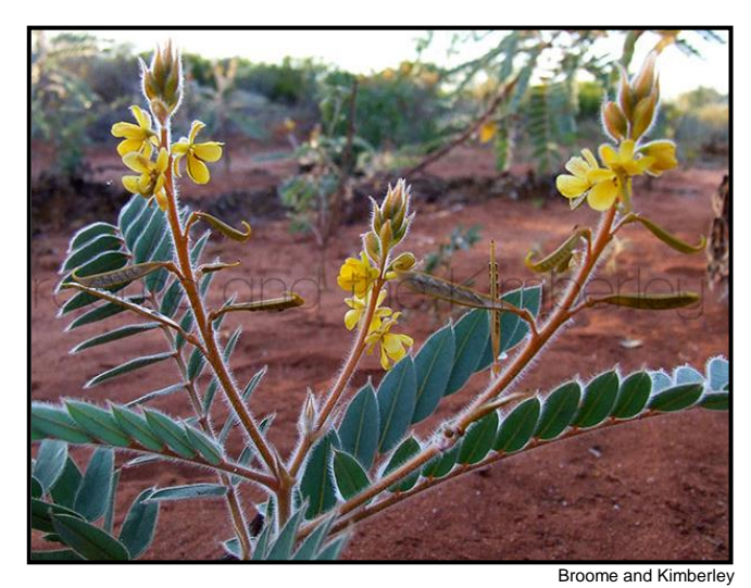
Cockroach Bush Senna notabilis