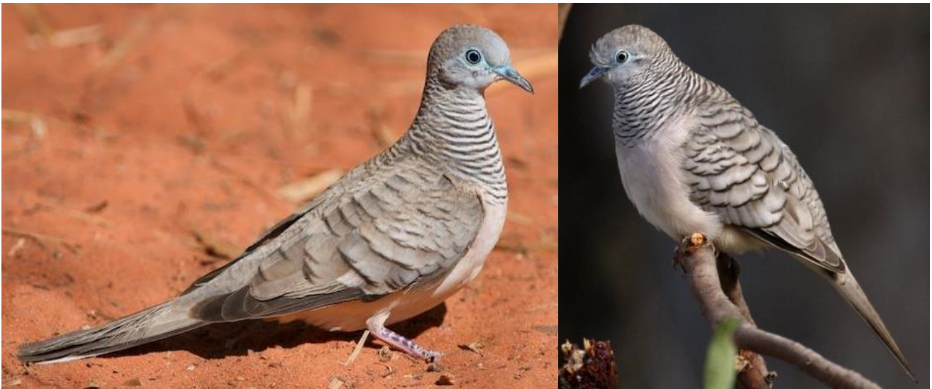
Peaceful Dove, Geopelia placida

Nest: Delicate nest twigs placed in a tree or dense bush.