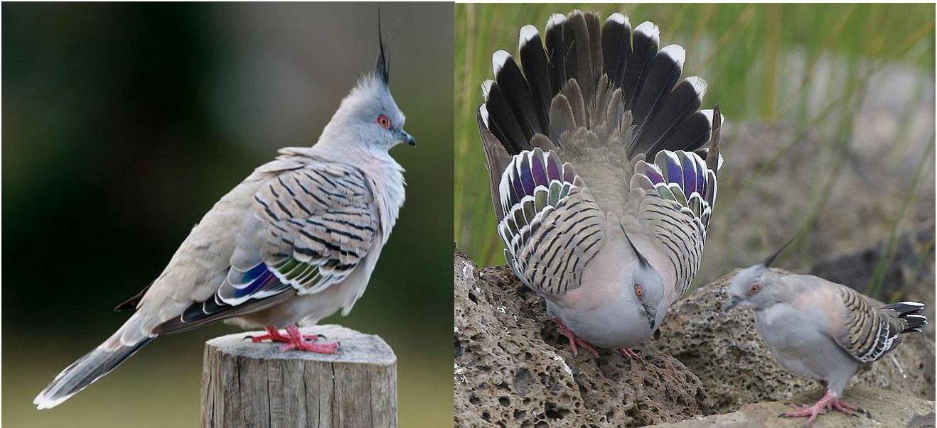
Crested Pigeon, Ocyphaps lophotes

Key ID Features: Long black upright crest. (Note: crest is held down flat along neck in flight). Red eye-ring. Yellow-orange eye. Grey body. Black bars on wings and a metallic green to purple patch. Tail tip white. Pink legs. Similar size to Spotted Turtle-dove (size: 31 – 36 cm). No neck bar.