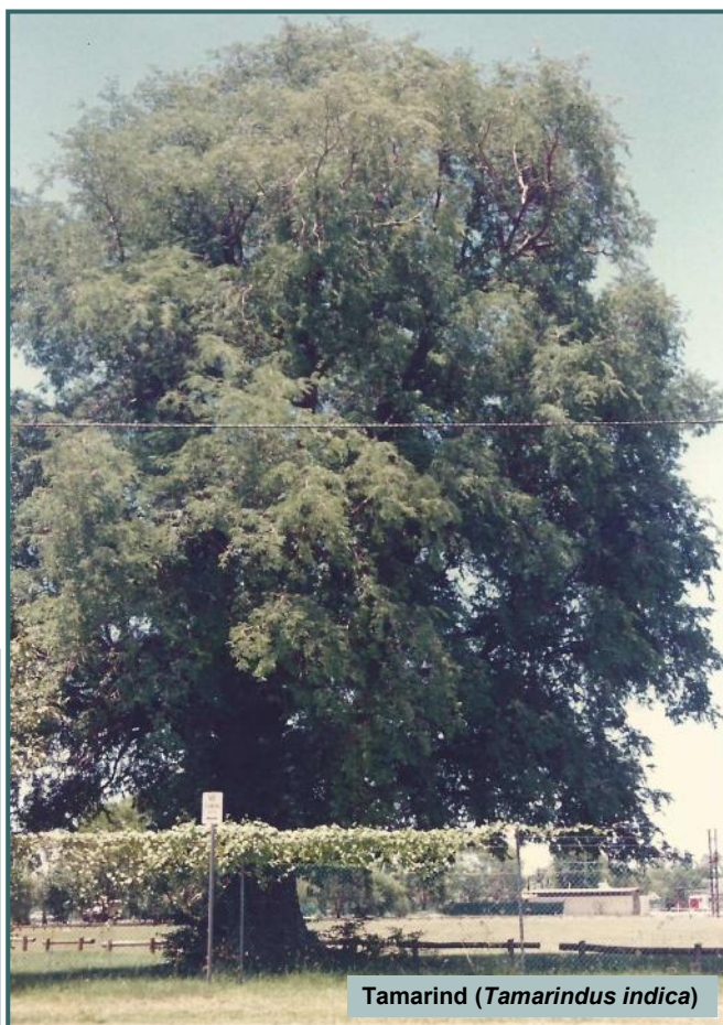
Tamarind ( Tamarindus indica )