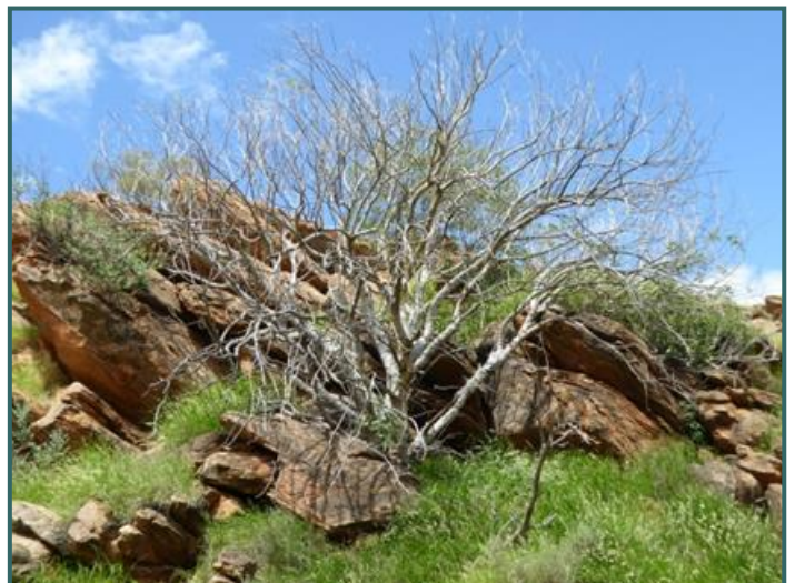
Above: The fig in full growth (1996) Right: The health of the fig is deteriorating (2017)

This Native Fig is part of the Billy Goat Hill sacred site, which has important cultural associations for the Arrernte people. It is an outstanding example of a Native Fig and an important landmark that is easily viewed from Stott Terrace. In recent years, the health of the tree has been deteriorating. Early in 2017, a fire swept across Billy Goat Hill and the tree has shown little signs of regrowth.