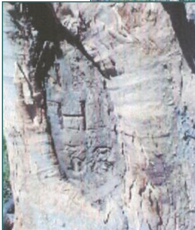
Above: Last known photo taken in 1989