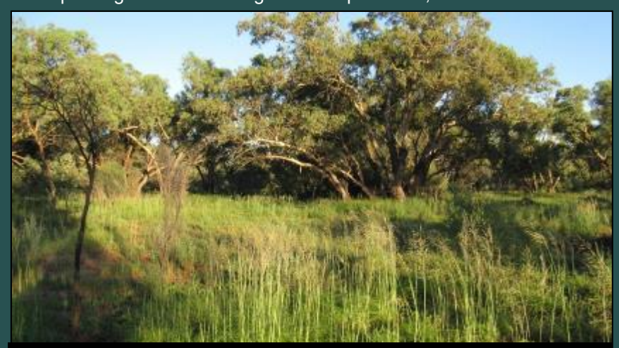
The vibrant green of a desert resource pulse in the Ilparpa forest after rains. The vibrancy of colours may be improved as a result of rain washing layers and layers of dust from the vegetation.

Contrastingly, when exceptionally large rainfall events occur, it can also prompt major changes in the landscape which include widespread germination and growth of ephemeral, annual and