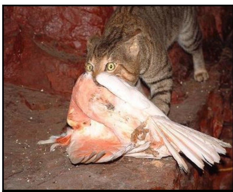
The end of life via predation from a feral cat for (another) Major Mitchell Cockatoo