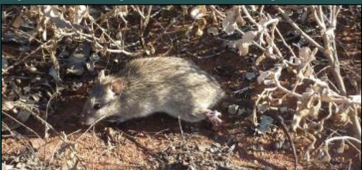
A native Long-haired Rat, Rattus villosissimus , vulnerable to the pressures of predation from introduced feral predators

vegetation or the vegetative structure of ecological communities exacerbate the risk of predation for vulnerable