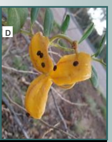
The rapid response following rain in the Central Australian desert's ecosystems. A) the Todd River flowing after receiving between 20-50 mm of rain over a period of 72 hours; B) Portulaca seedlings bursting through the moist soil within hours of rainfall; C) In a matter of days, fields of flowers carpet the ground in the Illparpa area; D) Wild Passionfruit produces fruit only days after rain