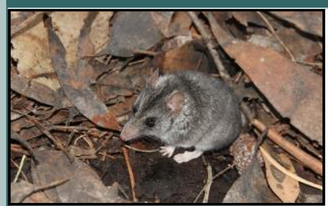
Following the loss of most of their remaining habitat, the desperate plight of the endangered Kangaroo Island Dunnart (above) sees them with little room left to move.

The west end of Kangaroo Island has been devastated by wildfire over the past summer and critically endangered species are on the brink of extinction.