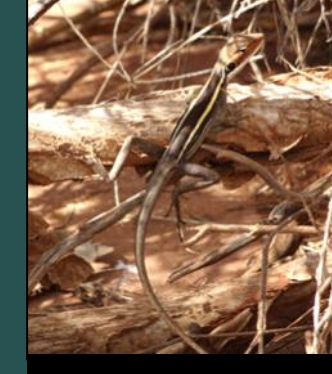
Long-nosed Water Dragon Amphibolurus Lophognathus longirostris

Letnic, M., and Dickman, C.R., <u>Resource pulses and mammalian dynamics:</u> conceptual models for hummock grasslands and other Australian desert <u>habitats</u> (2010)