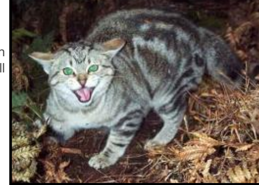
Just one of millions of feral cats that continue to impact on the persistence of native wildlife in the Australian environment

In 2016, Hugh and Sarah detailed their discovery that, not only do cats thrive after fires in their own territory, but they will also <u>travel many kilometres</u> outside their home ranges to burnt areas.