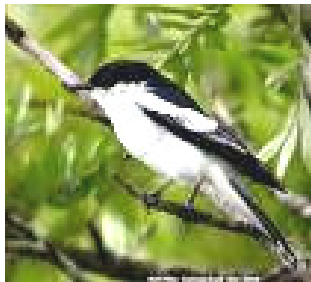
White-winged Triller

Before I start talking about what birds we will be seeing, I might mention a few more we probably won't. After all that rain we had, many plants sprung up and flowered and seeded, and caterpillars, grasshoppers and all sorts of insects appeared en masse. Water will dictate the presence of many nomadic birds, we had a big turn out over summer, now they gradually are leaving us. Along with the Triller, Bee-eater and Kingfisher, it is unlikely that we will see things like the Cockatiel, Mulga parrot, and Budgerigar over the colder months.