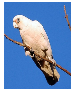
Little Corella

The Port Lincoln Ringneck Parrot will enjoy the wattleseed, as well as the local Little Corella population, and of course the Galah. Don't begrudge the pruning these parrots do on Ironwoods and Eremophilas while they get new growth to eat. They are doing the trees, if not you, a favour by reducing the foliage on the trees in anticipation of drier times that invariably follow after the rains. If you're lucky enough or have planned a corner of your garden where the sharp seeds of copper burrs and Caltrop can survive, you may even have Red-tailed Black Cockatoos turn up on your property.