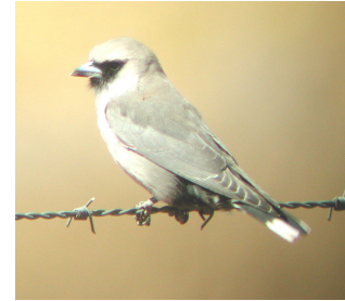
Black-faced Woodswallow

Many birds in transit from south to north are staying a while in Alice Springs. You may notice an increase in Black Kite numbers as the local resident population is boosted by migrating birds heading north. Similarly the Black-faced Woodswallow have stuck around for a little while taking advantage of the flowering trees. They feed on nectar even though they are largely insectivorous. Their near cousins, the Masked Woodswallow have already long gone.